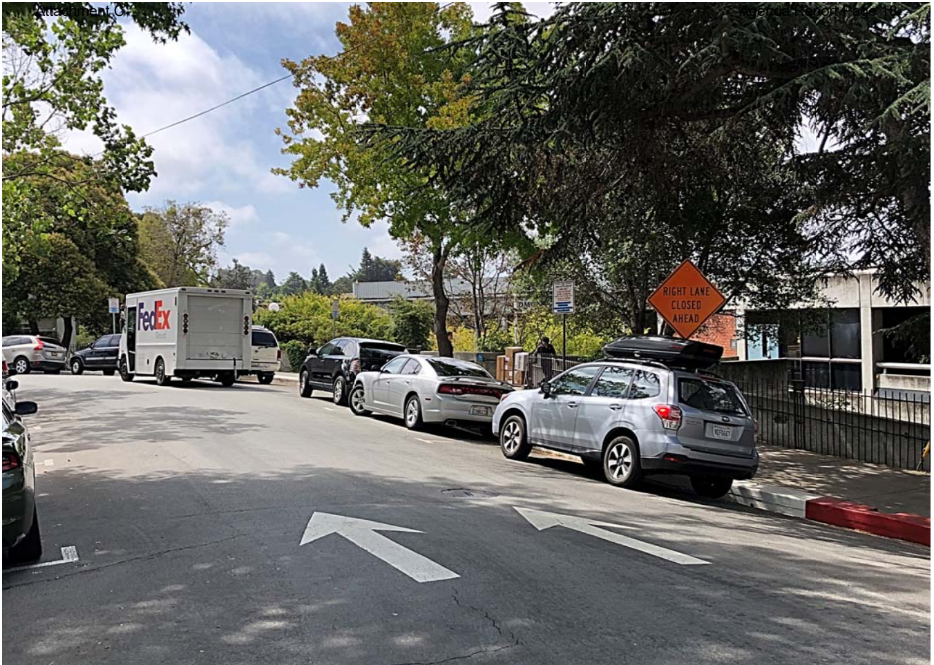
EXISTING LOADING ZONE @ PIEDMONT MIDDLE SCHOOL